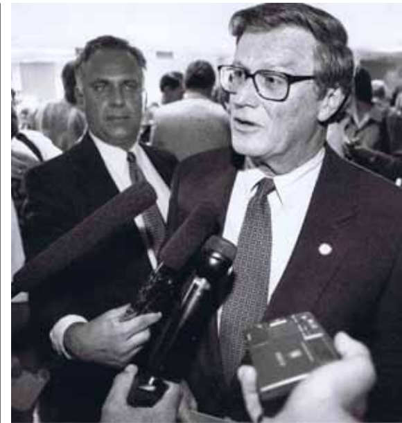
John talks with reporters during his tenure as Speaker of the House

As Speaker, John helped Governor Bush enact powerful and important reforms for Florida , including an overhaul of the state's education system that improved test scores and increased higher learning opportunities for Florida children. Governor Bush signed balanced budgets during each year of John's